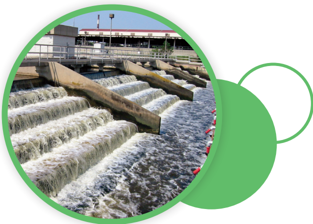
Effluent leaving a wastewater facility.

DESALINATED WATER: Saline water that has had its dissolved salts removed. – U.S. Geological Survey (USGS), 2016a